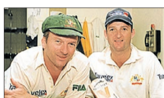
HOWZAT: Former cricketers, twins Steve and Mark Waugh.

■ 1965: Australian Test cricketers, twins Mark and Steve Waugh, were born. They turn 45.